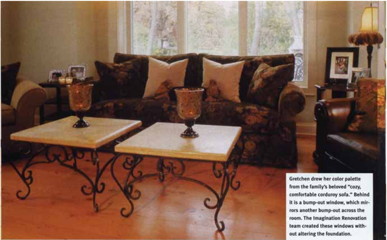
Gretchen drew her color palette from the family's beloved "cozy, comfortable corduroy sofa." Behind it is a bump-out window, which mirrors another bump-out across the room. The Imagination Renovation team created these windows without altering the foundation.