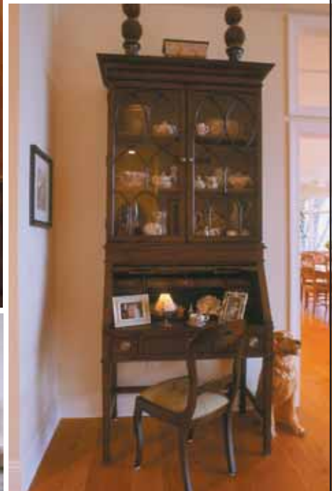
Heirloom dishes are displayed in the Beutlers' dark-wood secretary. The chair is also handy when extra seating is needed in the living room.